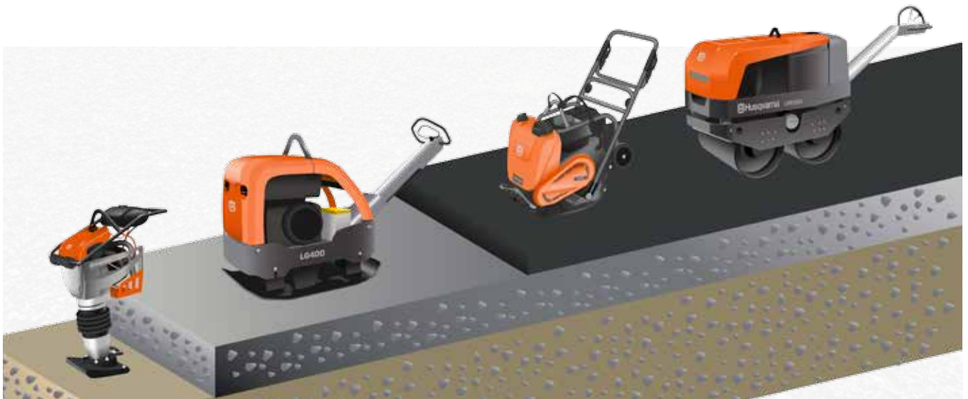
The new compaction range from Husqvarna includes tamping rammers, reversible plate compactors, forward plate compactors for soil and asphalt, and duplex rollers.